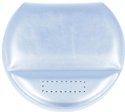
1. FRONT BOTTOM