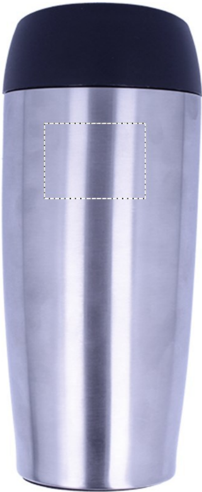
1. FRONT TOP