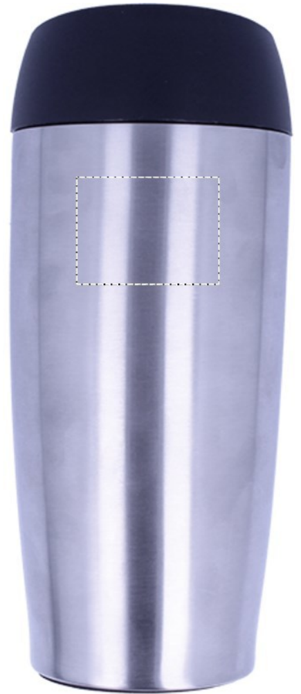
3. BACK TOP