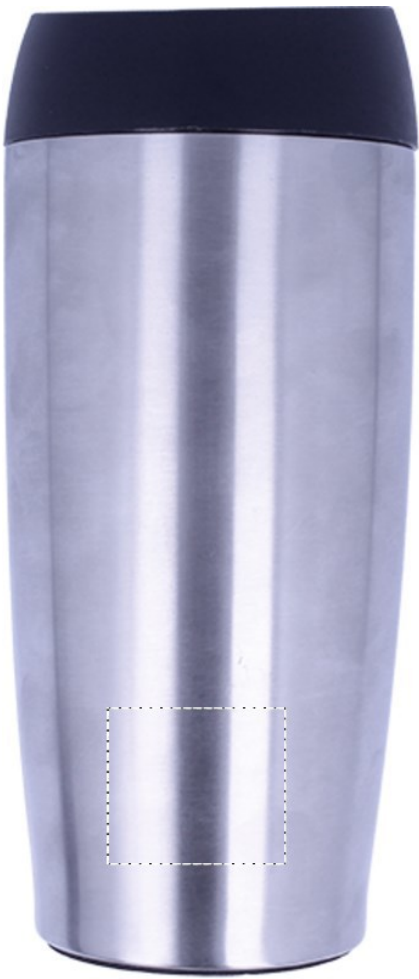
4. BACK BOTTOM